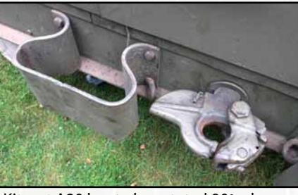
Kitpart A20 has to be rotated 90° when back door is opened.